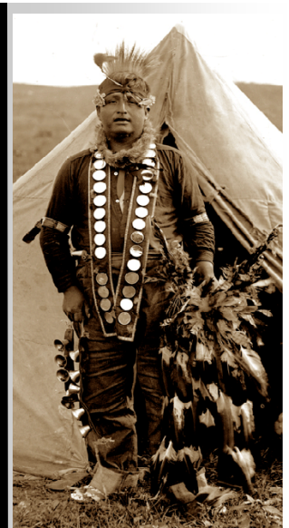
This 1915 photo shows a young Native American dancer in traditional Lakota dance attire complete with dance bells and feather headdress.